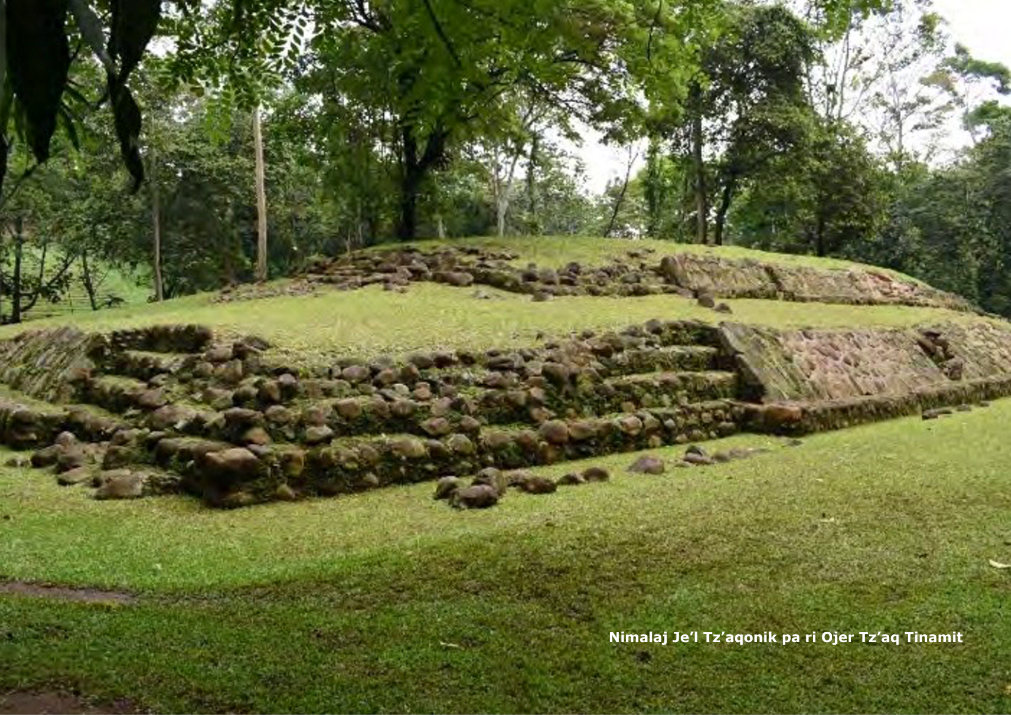
Nimalaj Je'l Tz'aqonik pa ri Ojer Tz'aq Tinamit