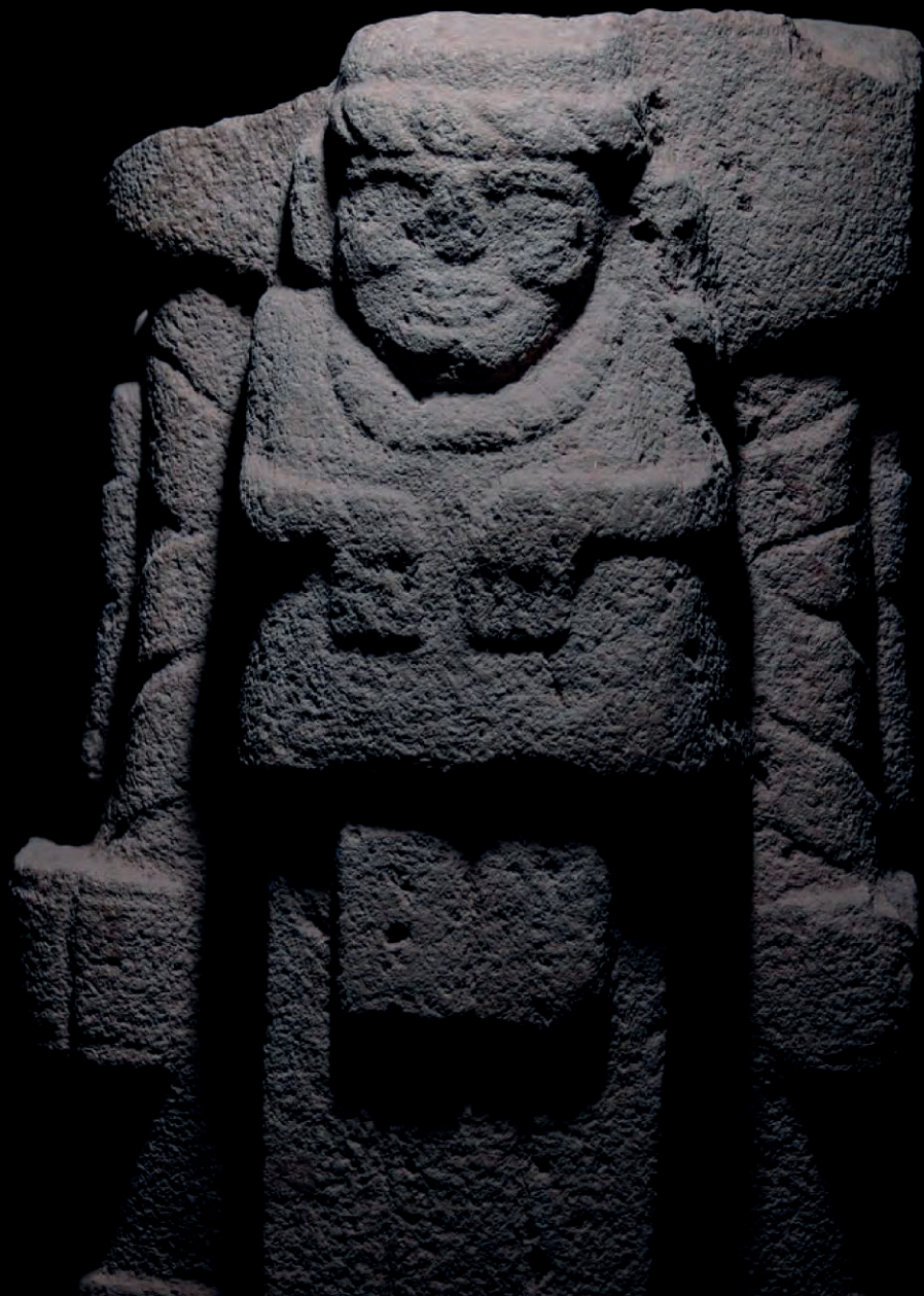
Josom ab'aj "Eqanel rech Mam"