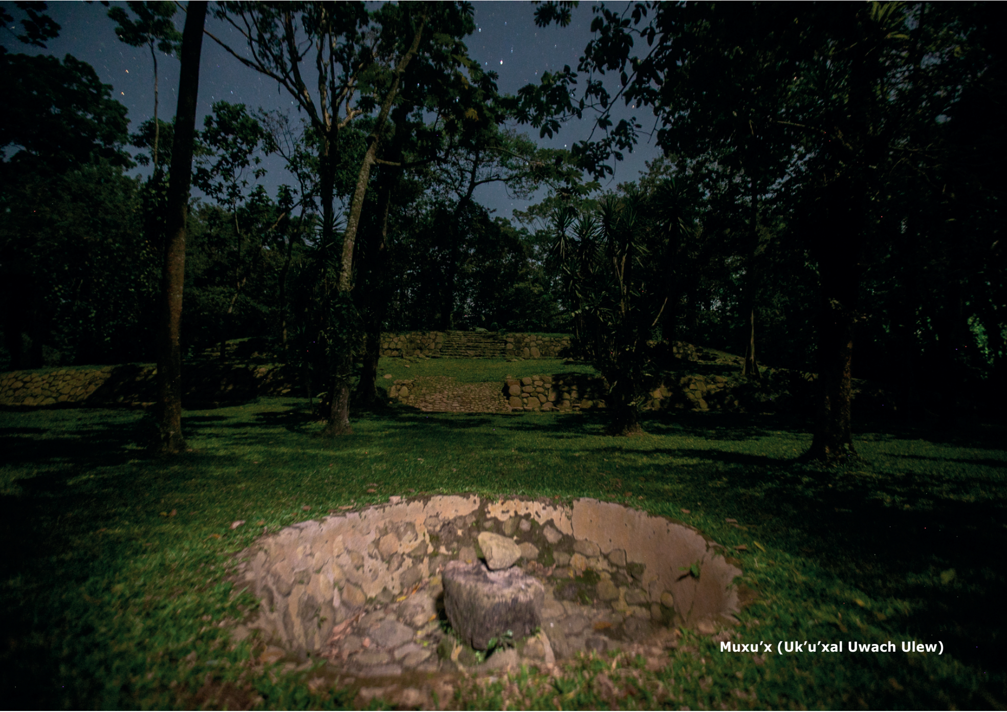
Muxu'x (Uk'u'xal Uwach Ulew)