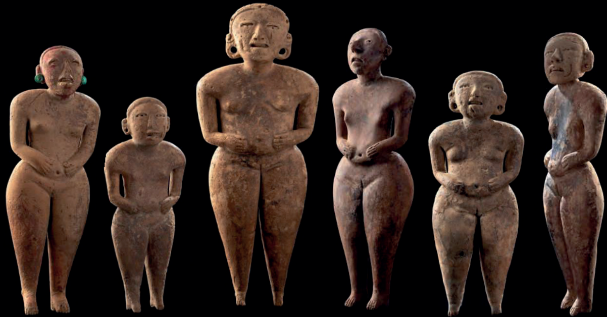
Sipanik rech kaminaq "Taq Ala's"