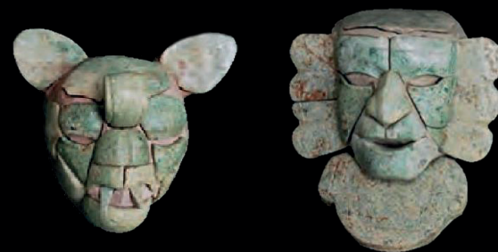
Laj taq raxab'aj e jolomaj rech kojb'al