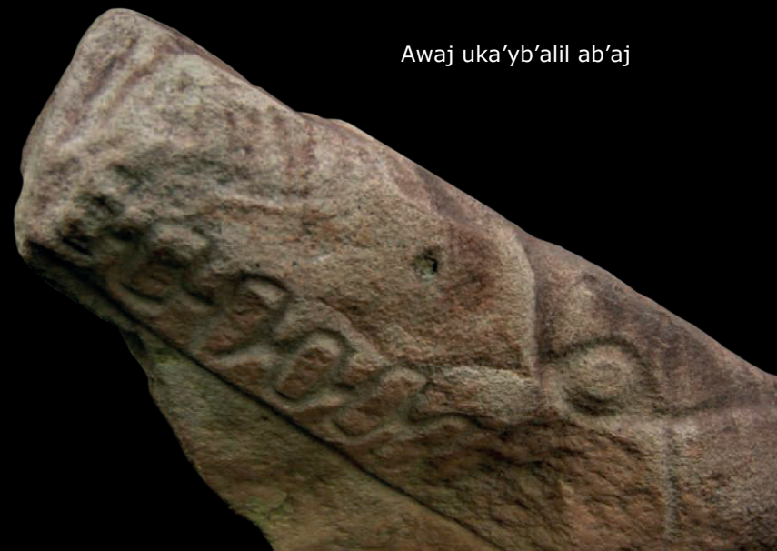
Awaj uka'yb'alil ab'aj

Xriqitaj ab'aj kech kaminaqib', jun sipanik kech kaminaqib', are waqib' taq b'o'j ala's kepetik, e q'apoj taq ixoqib' e ya'tal koq pa taq kajib' uxkut ri uwach ulew pa ub'e le loq'olaj q'ij. JE'LA TAQ AB'AJ KECH KAMINAQIB'